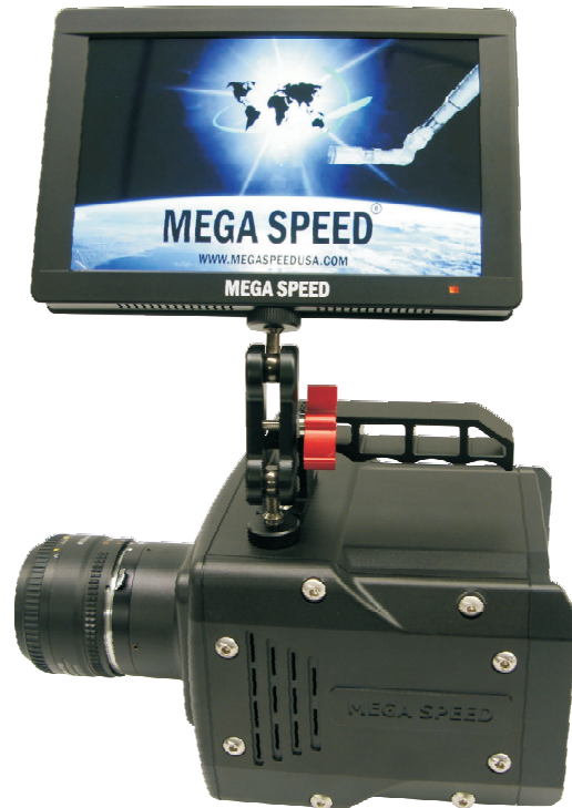
MS160K model shown with optional 32 GB black camera body and on-camera monitor.

Our Mega Speed high speed cameras continue to offer the world's high speed imaging customers with some of the most productive high speed camera designs available. A camera design providing the customer with the very best features and prices available.