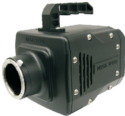
MS160K front view.